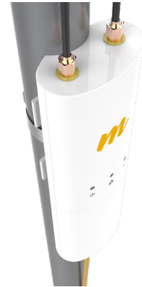
C5c on Pole

**4.9 GHz uses 20 MHz channel widths (US only, regulations vary by region)